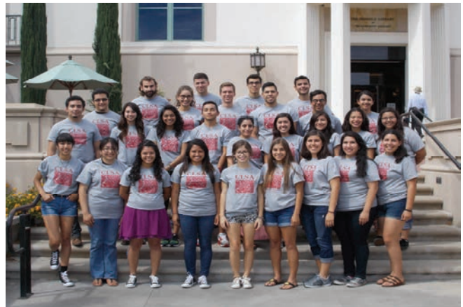
Our current CLSA Sponsor Team