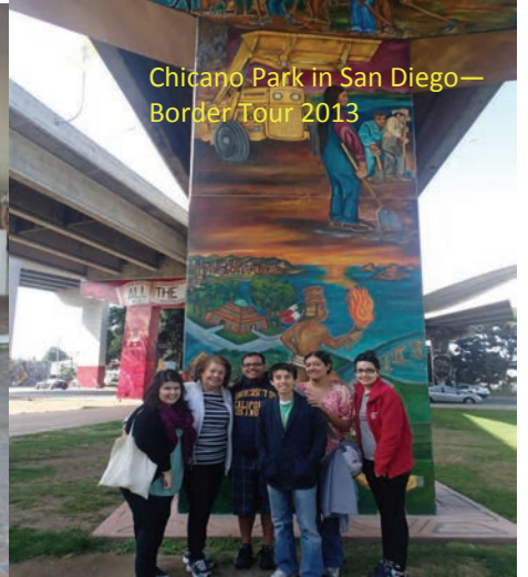
Chicano Park in San Diego— Border Tour 2013