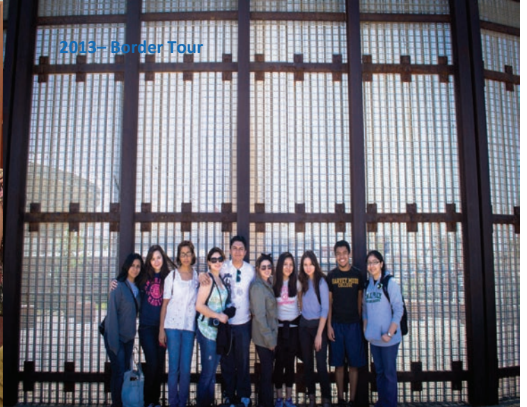
2013- Border Tour