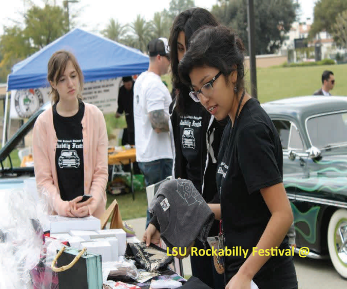
LSU Rockabilly Festival @