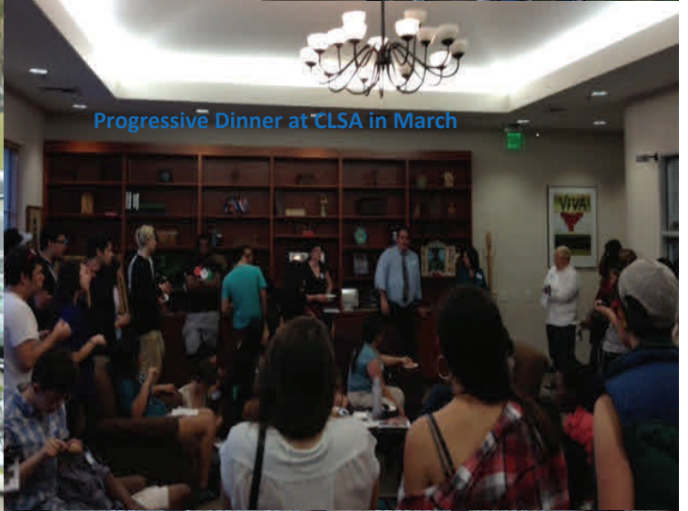
Progressive Dinner at CLSA in March