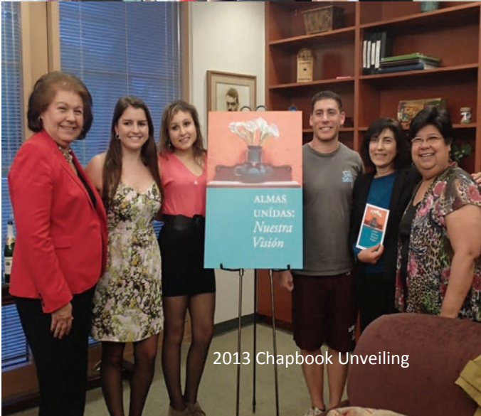
2013 Chapbook Unveiling