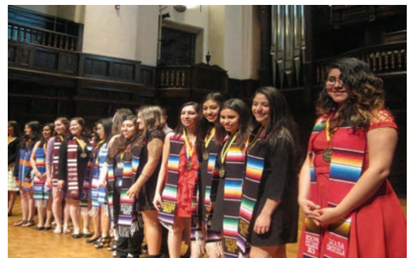
Smiling seniors after receiving their graduation stoles and senior medals.