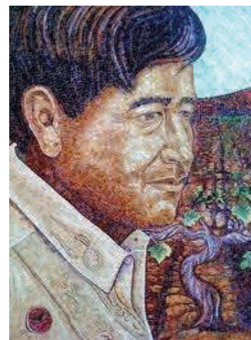
César E. Chávez Mosaic by artist Judith Baca